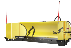
QuattroPlow® 6,000-10,000 lbs.